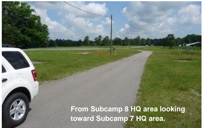
From Subcamp 8 HQ area looking toward Subcamp 7 HQ area.

Subcamp 8: Gateway location not previously indicated. Asked for placement near Lee Drive and HQ tent.